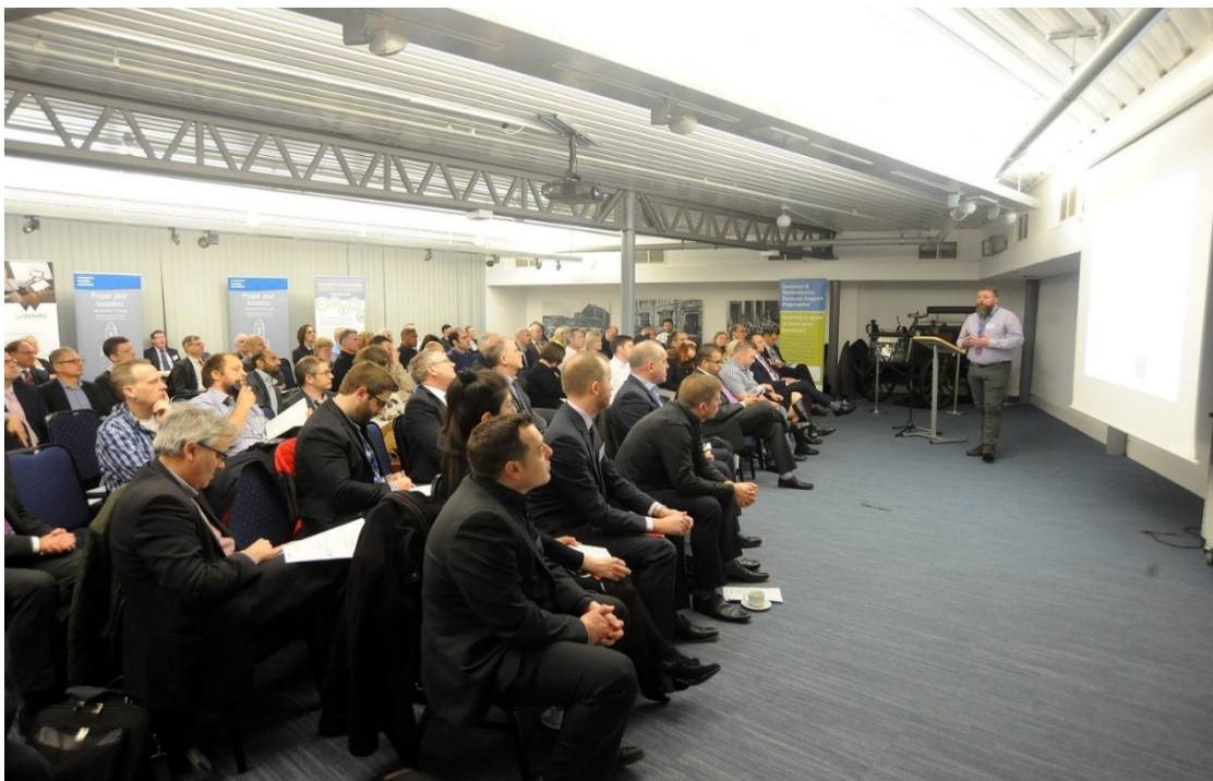
(Launch event for the Coventry & Warwickshire Innovation Programme)